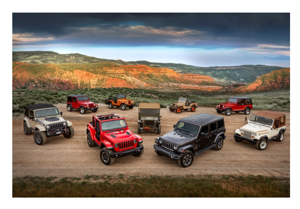
All-new 2018 Jeep Wrangler Rubicon and Sahara with various historical Wrangler vehicles

2017 has also been the year of Alfa Romeo's revival with the launch of Giulia and Stelvio proudly conceived and crafted in Italy. These were strongly welcomed by the media worldwide and, more importantly, by old and new "Alfisti" (Alfa customers). Their launch is another key step in growing our position in the premium car market.